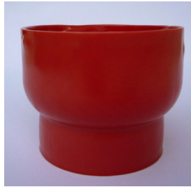
PET+PC-cup at 250 °C

You can see the opacity of the PET+PC cup clearly. It is a hint for the usage at high temperature. So you will be warned early enough to extinguish the flame. The crystallisation increases the heat resistance to keep molten wax longer safe inside the cup.